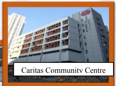
Caritas Community Centre